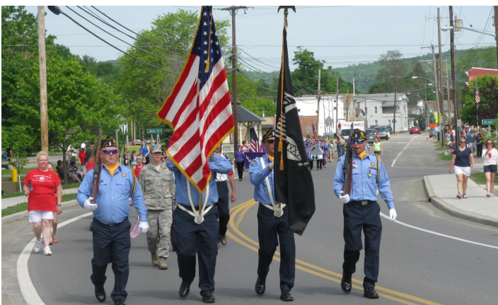
(Photo: 2015 Memorial Day Parade led by the Candor American Legion Post 907 Color Guard)